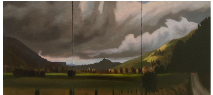
Work by A-F Fulgence

Under the direction of Anne-France (A-F) Fulgence you will safely use and explore a range of materials, media, techniques and equipment, and engage in studio practices that express and explore personal concepts. Mixed media drawing, how to loosen up. Basic colour theory, how to keep it simple. Traditional and contemporary techniques and materials. Go beyond your creative block. Develop skills that you always wanted. Experiment with your creativity. Design something stunning. Learn new techniques and methods. Make new friends.