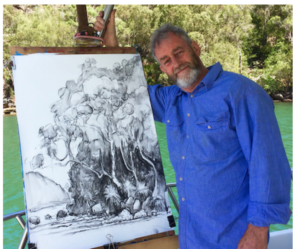
conventions and literally find their own way.