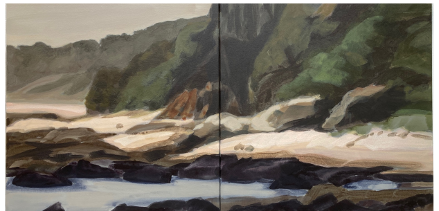
Work by A-F Fulgence